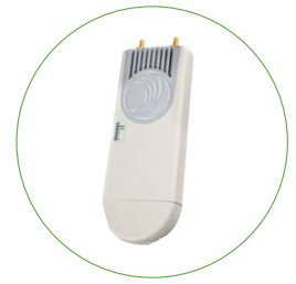
ePMP 1000 GPS Sync Radio

Using the 5 GHz frequency spectrum, the new ePMP architecture is the most effective connectivity solution for reaching the under- and unconnected around the world.