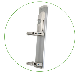
ePMP 1000 GPS Sync Radio Integrated with a Sector Antenna